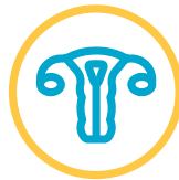
Gynaecological cancers (cervical, ovarian, uterine)