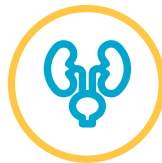
Urological cancers (prostate, bladder, kidney, testicular)