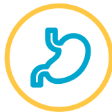
Gastrointestinal cancers (oesophageal, stomach, colorectal, pancreatic, liver and gallbladder)